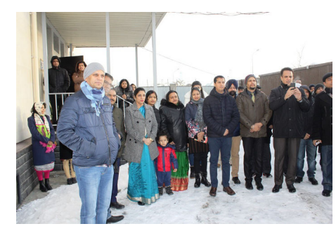
Celebration of Republic Day, ICCR and ITEC Days in Astana