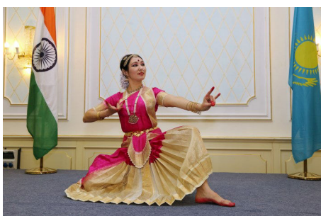
Celebration of Vishwa Hindi Divas in Astana