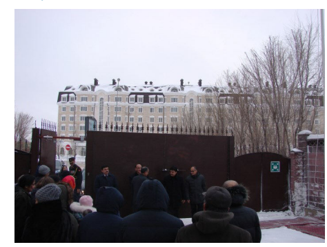
Flag Hoisting Ceremony in Almaty