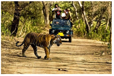
Panna National Park