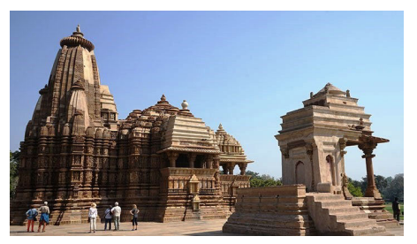
Kandariya Mahadev Temple